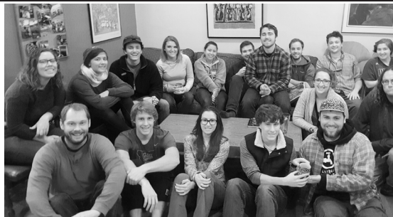
Catholic and Emmaus shared study on Christianity