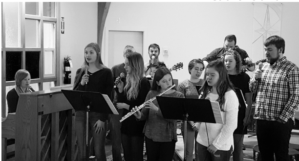
Worship team at Immanuel Lutheran Church