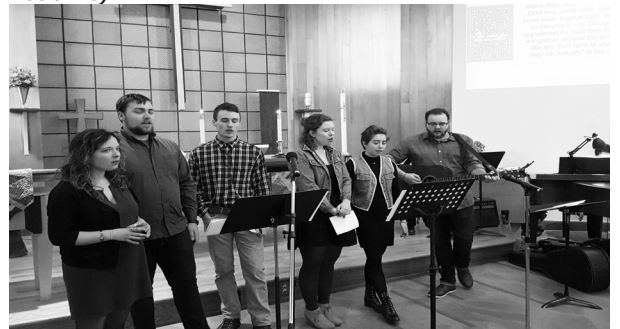
Worship team at Bethel Lutheran in Great Falls