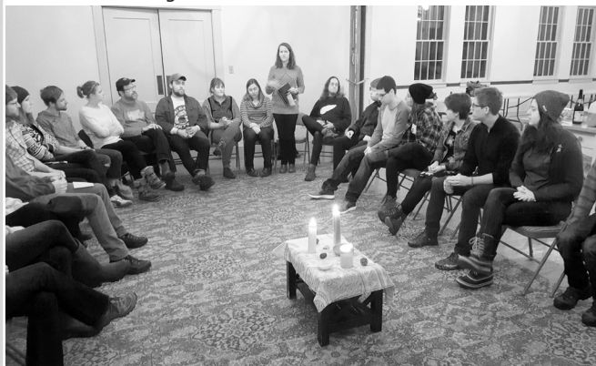
Confluence meeting at UCC Church